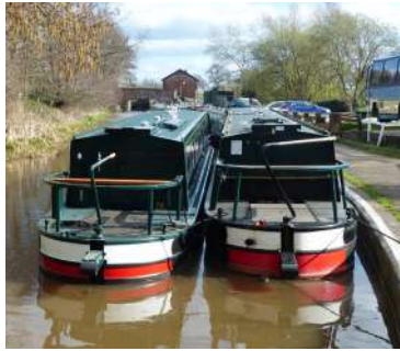
Shropshire Union Canal