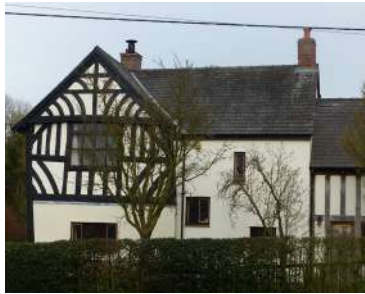
Bunbury - Chantry House