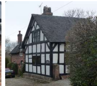
Church Bank Cottage