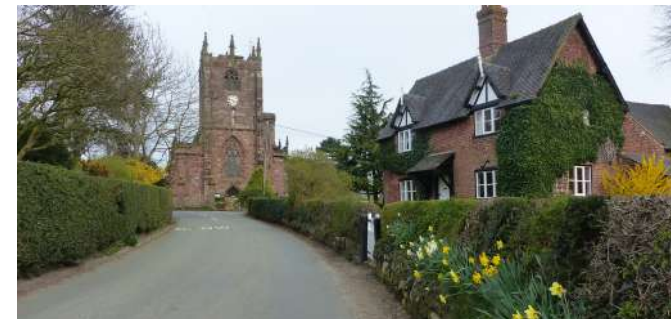
Bunbury Vicarage Lane