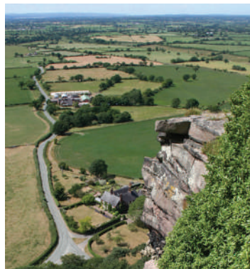
Beeston Castle View