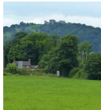
Beeston Castle - distant view