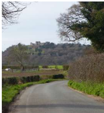
Beeston Castle - from Beeston Moss